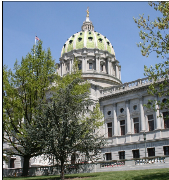
Pennsylvania State Capitol, Harrisburg, PA

➤ ➤ ➤ Pennsylvania Manufactured Housing Political Action Committee